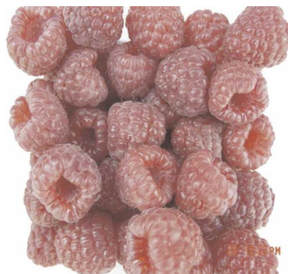
Fig. 1. Fruit of 'Nantahala' red raspberry.

Mountain Horticultural Crops Research Station in Mills River, NC, in 2004 and 2005 for a total of 4 years. Plantings were arranged in randomized block designs with two replications in Mills River and four replications in Laurel Springs. Five plants were originally set in each plot at 1.2 m between plants and 2.4 m between rows. Plants were allowed to